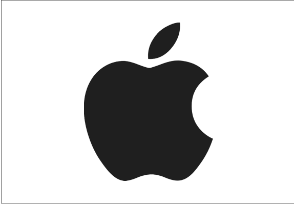
Journey of Promise #7